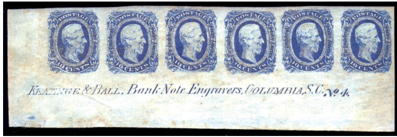
Sc. 11, Die B, Keatinge & Ball