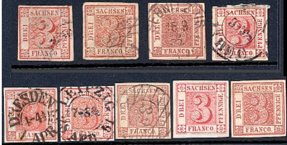
Counterfeit singles. See also page 12.