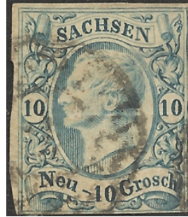
10ngr, Sc. 14

colors were used. No change was made in the 3pf value, as it bore the coat-of-arms, and this denomination continued to be printed by Hirschfeld. It was found desirable to have higher values than 3ngr for use on letters sent beyond the confines of the German-Austrian postal union and on April 24th, 1856, 5 and 10ngr stamps were issued. In design these were similar to the lower values but they were printed in color on white paper instead of in black on colored papers as was the case with all previously issued neugroschen stamps.