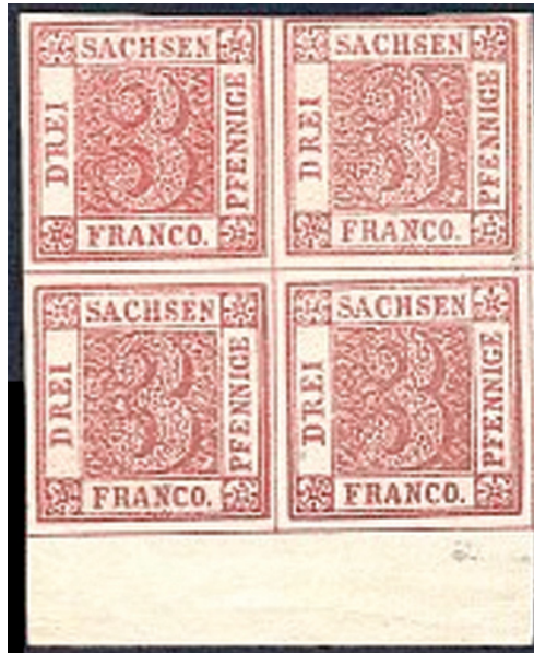
A counterfeit block of four. See also page 12. Use your pdf magnifier tool for a closer look.

In the inscriptions the S and A in SACHSEN almost join, as also do the R and E in DRIE. There is a break in the inner line of the frame opposite the I of DRIE.