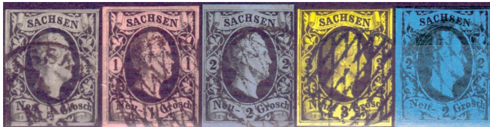
1851-52 Issue: Sc. 3 (1/2ng black on gray), 5 (1ng black on rose), 6 (2ng black on pale blue), 8 (black on yellow) and 7 (black on dark blue, issued in 1852). There is no Scott 4 listing.

With the exception of the portrait the design was altered as little as possible; the values were the same and the same