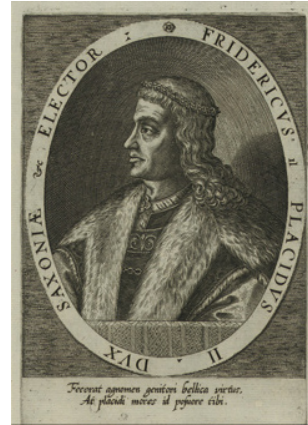
Frederick II, Frederick the Mild

The house of Ascania becoming extinct on the death of Albert III (1422), the Emperor Sigismund invested Frederick the Warlike, margrave of Meissen, with the electoral title and the duchy of Saxony.