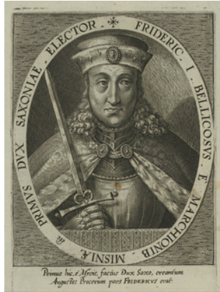
Frederick I, Frederick the Warlike

of the empire by which the duchy was dissolved, and its name transferred to the country inherited by Bernhard from his father, to which from that time the ducal dignity was attached.