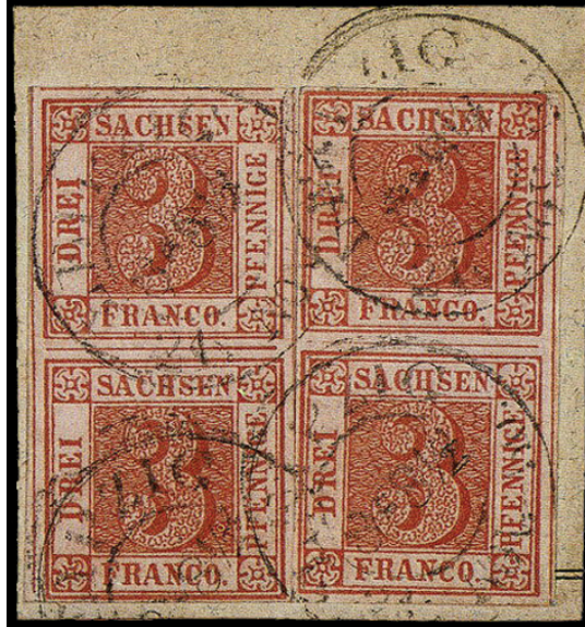
This superb used block of four shows the horizontal lines as broken and the vertical lines as continuous. See also page 10.

It is probable only twenty moulds were made, for the stamps were printed in sheets of twenty in four horizontal rows of five. It has been suggested that there was another plate used for some of the later printings but no satisfactory proof of this has been produced. Lines of printer's rule were placed between the casts and in referring to these Mr. Westoby says they ran "vertically down the sheet uninterruptedly; but the horizontal lines