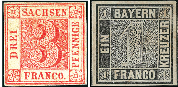
Saxony and Bavaria 1

Among all the stamps issued by the various German States none is more popular than the first stamp issued in Saxony—the 3 pfennige red. It is not a very