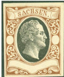
Essay for the 1851 issue

King Frederic died on August 9, 1854, and was succeeded by his brother John. Steps were at once taken to provide new stamps and though these were ready by the end of the year they were not issued until June 1st, 1855. The numismatic rule of setting the profile of a reigning sovereign the reverse way to that in which it was placed on the coins etc., of his predecessor was followed.