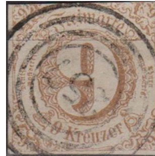
9 kr, Scott 55

1sgr, blue for the 2sgr and brown for the 3sgr. By this time the value of the gulden had deteriorated and was now worth about 40¢ U.S. currency instead of 48¢ as