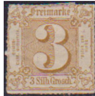
3 sgr, Scott 26