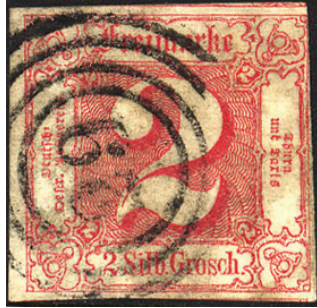
2 sgr, Scott 6

Baden, Bavaria, etc., was of considerable importance since by it the postal arrangements over a large portion of central Europe were regulated