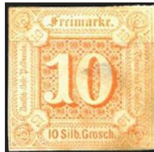
10 sgr, Scott 14

In 1859, the Thurn and Taxis office abandoned the use of colored papers and, instead, printed its stamps in color on white paper. As the stocks of those