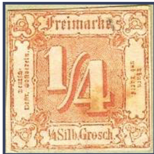
1/4 sgr, Scott 8

In 1859, the Thurn and Taxis office abandoned the use of colored papers and, instead, printed its stamps in color on white paper. As the stocks of those