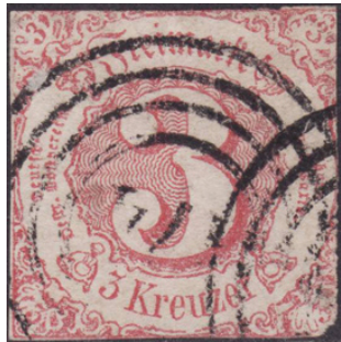
3 kr, Scott 53

1sgr, blue for the 2sgr and brown for the 3sgr. By this time the value of the gulden had deteriorated and was now worth about 40¢ U.S. currency instead of 48¢ as