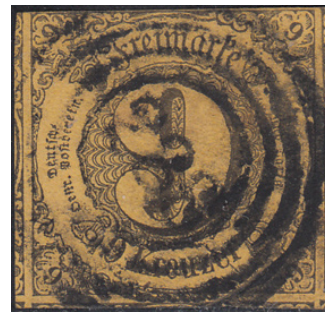
9 kr, Scott 46

150 electrotypes for each value and these were clamped together in a chase in fifteen horizontal rows of ten each to form the printing plates. They