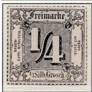
1/4 sgr, Scott 27

The colorless roulette gave considerable dissatisfaction owing to the manner in which it cut into the stamps and in 1866 this defect was remedied by rearranging the electro-casts so that there was a space of about 1 1/2 mm. between them. In the spaces between the electros, both vertically and hori-