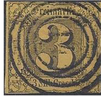
3 sgr, Scott 7

Baden, Bavaria, etc., was of considerable importance since by it the postal arrangements over a large portion of central Europe were regulated