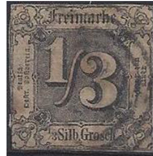
1/3 sgr, Scott 2

design to the others of the series but has the value in the centre on a ground of wavy lines. It was printed in black on red-brown paper the size of the sheets apparently being