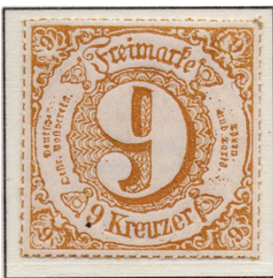
9 kr, Scott 59

zontally, brass strips known as “printer’s dotted rule” were inserted. This rule has a sharp edge divided into short lines (in this instance 16 in the space of 2 centimetres) and stands a trifle higher than the printing surface of the electro-casts. Consequently when the stamps are printed the rule is inked as well and cuts into the paper forming the variety known as “rouletting in colored lines.” This system not only saves time, for the stamps are printed and perforated at one operation, but it has the advantage from obsolete for a period of no less than 43 years. This reprinting took place in 1910 but under whose authority I cannot trace. The list of stamps reprinted is as follows: a collecting point of view, of making the stamps perfectly