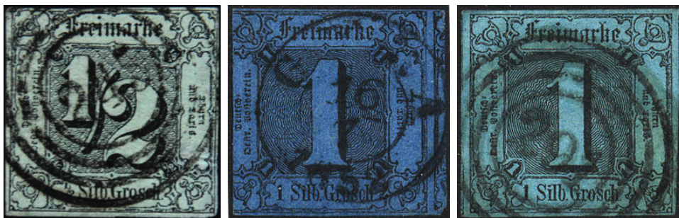
1/2 sgr, Scott 3; 1 sgr, 4 (on dark blue) and 5 (on light blue paper)

The Thurn and Taxis Post Office, as I have already stated, had its central administration at Frankfort, and, as it joined the German Austrian Postal Union in 1851, it became necessary to provide postage stamps, to conform to one of the regulations of the convention. This Postal Union, as has been pointed out in the history of the stamps of