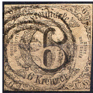
6 kr, Scott 45