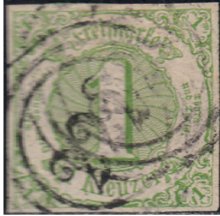
1 kr, Scott 47

printed in lilac, and 10sgr and 30kr printed in orange. The designs somewhat closely resemble those of the other stamps then current, but the side