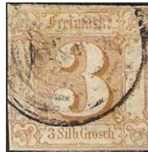
3 sgr, Scott 20

In March 1861, the Prussian Postal Administration addressed a circular to the various States forming the GermanAustrian Postal Union proposing that uniform