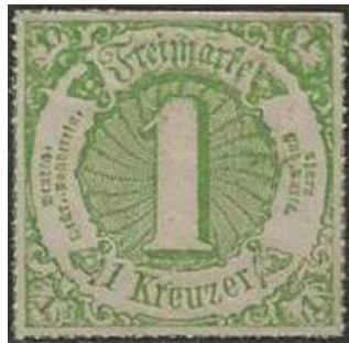
1 kr, Scott 56