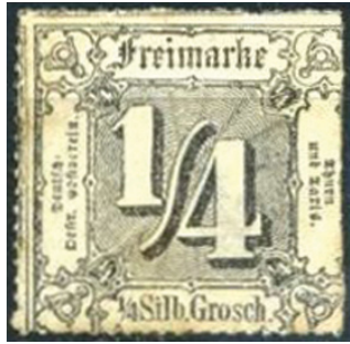
1/4 sgr, Scott 21