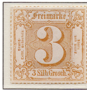
3 sgr, Scott 32

The colorless roulette gave considerable dissatisfaction owing to the manner in which it cut into the stamps and in 1866 this defect was remedied by rearranging the electro-casts so that there was a space of about 1 1/2 mm. between them. In the spaces between the electros, both vertically and hori-