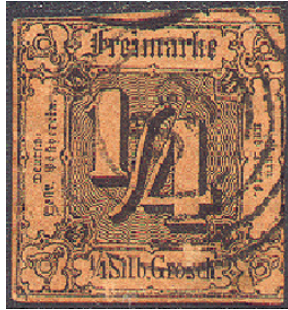
1/4 sgr, Scott 1

design to the others of the series but has the value in the centre on a ground of wavy lines. It was printed in black on red-brown paper the size of the sheets apparently being