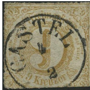
9 kr, Scott 59