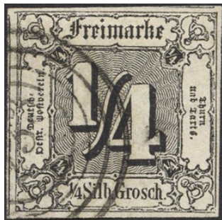
1/4 sgr, Scott 15

In March 1861, the Prussian Postal Administration addressed a circular to the various States forming the GermanAustrian Postal Union proposing that uniform