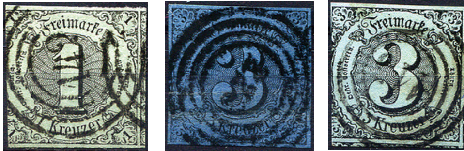
1 kr, Scott 42; 3 kr (on dark blue), Sc. 43; 3 kr (on blue), Sc. 44

The stamps for the Southern States, with values in kreuzer, show similar inscriptions but on a circular band, the small posthorns separating the inscriptions. The large numerals of value in the centre are on an engine-turned ground of circular shape and, as in the case of the silbergroschen series, the pattern of this differs for each denomination. The rectangular shape of the design as a whole is obtained by the addition of ornamental scrollwork at each angle, there being small numerals of value in the centre of the decoration at each corner. The inscription at the left on all these stamps is simply the German rendering of “German Austrian Postal Union.”