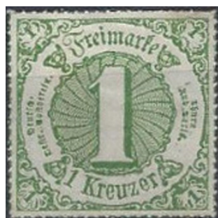
1 kr, Scott 56