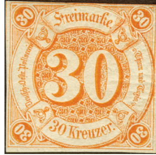
30 kr, Scott 52

printed in lilac, and 10sgr and 30kr printed in orange. The designs somewhat closely resemble those of the other stamps then current, but the side