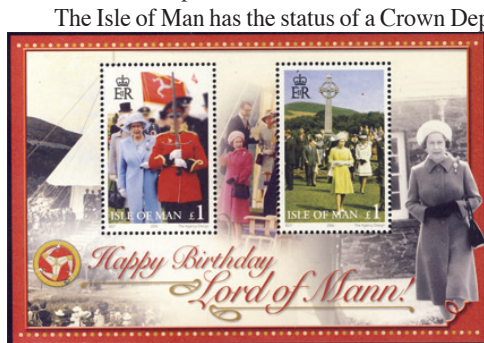
2006 80th birthday of Queen Elizabeth II, as Lord of Mann

The Isle of Man has the status of a Crown Dependency, so it is not part of the United Kingdom, but the UK takes care of foreign relations and defense, and the British parliament can enact legislation that also applies to the island, but seldom does. Queen Elizabeth II is styled Lord of Mann as