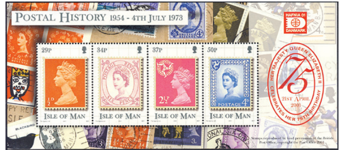
2001 souvenir sheet showing GB Sc. MH1, Sc. 300 and Isle of Man regionals Sc. 8 and Sc. 3 (souvenir sheet overprinted for Hafnia 01)

The first postage-stamps with a Manx relation were the British regional stamps, first issued in 1958, the last issued 1971. The 1958-69 issues featured a Wilding portrait of Queen Elizabeth II, whereas the 1971 issue had a Machin portrait. In addition, all regional stamps of the Isle of Man featured the island's arms, the triskelion (three running legs).