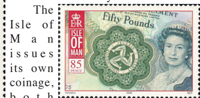
2008 showing Isle of Man banknote

both coins and bank notes, and in 2008, a set of six stamps reproduced a number of Manx bank notes.