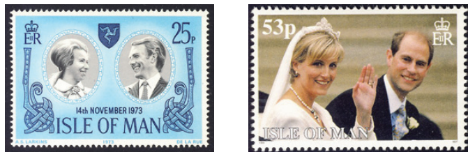
Left, 1973 Wedding of Princess Anne and Mark Phillips (Sc. 35); right, 1999 Wedding of Prince Edward and Sophie Rhys-Jones (Sc. 837B)

The fourth special issue was devoted to the wedding of Princess Anne and Captain Mark Phillips. Queen Elizabeth's silver jubilee was celebrated with 1977 stamps, and a 1978 stamp marked the 25th an-