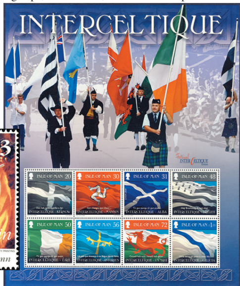
Left, 1999 Centenary of Manx Gaelic Society (Sc. 827); right, 2008 Souvenir sheet for Interceltique Festival

The Manx Gaelic heritage was in the forefront when in 1999, a set of four stamps celebrated the centenary of the Manx Gaelic Society.