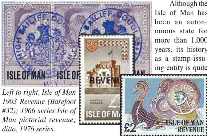
Left to right, Isle of Man 1903 Revenue (Barefoot #32); 1966 series Isle of Man pictorial revenue; ditto, 1976 series.

young, starting in 1973, although distinct revenue stamps had been issued for the Isle of Man since 1884, with pictorial revenues introduced in 1966.