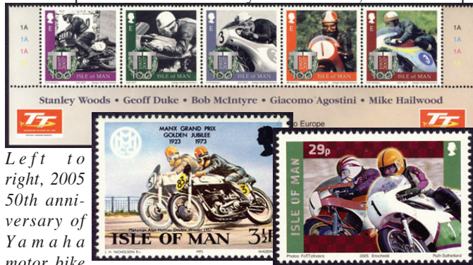
Left to right, 2005 50th anniversary of Yamaha motor bike manufacturers; 2007 strip for centenary of Tourist Trophy race; 1973 for 50th anniversary of Manx Grand Prix (Sc. 34) set of "All Time Greats" was issued.

Motorcycle races were the theme of the third special stamp issue, issued for the golden jubilee of the Manx Grand Prix. The more famous Tourist Trophy race was first celebrated with a 1974 set, with further sets added 1975, and in 1977, stamps celebrated the 70th anniversary of the TT races. Already in 1982, another set celebrated the 75th anniversary of the TT Races, and a 1991 set marked the 80th anniversary of the TT Race's mountain course. A 1996 set celebrated Irish winners of the TT Races, and a 1998 set marked the 50th anniversary of the Honda motorcycle manufacturers. A 2009 set celebrated famous TT drivers using Hondas. The 50th anniversary of the Yamaha manufacturer was the theme of six 2005 stamps. A 2001 set celebrated Joey Dunlop, a TT Champion, and another champion, Geroge Formby was celebrated on 2004 stamps. 2007 saw the centenary of the TT Race, and a ten stamps