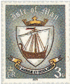
1979 Millennium of Tynwald, showing arms of Tynwald (Viking ship) (Sc. 146)

The Isle of Man has an area of 221 square miles and a population of 80,000. The island had a Celtic legacy when the Scandinavian Vikings started to settle on the island at the end of the 8th century. The Norse kingdom of Man and Sudur (Southern Isles) was created in 1079, and remained under Norwegian supremacy until it was ceded to Scotland in 1266, but it later came under England, and retained a certain degree of autonomy. Full autonomy was restored in 1866. The island's parliament, the Tynwald, was established AD 979 by the Norse settlers, and is the world's oldest continuous parliament.