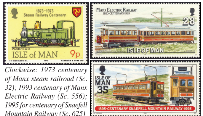
Clockwise: 1973 centenary of Manx steam railroad (Sc. 32); 1993 centenary of Manx Electric Railway (Sc. 556); 1995 for centenary of Snaefell Mountain Railway (Sc. 625)

The first special stamp issue of the independent Isle of Man post-office was a set celebrating the centenary of the island's steam railroads. A 1998 set marked the 125th anniversary of the steam rail-