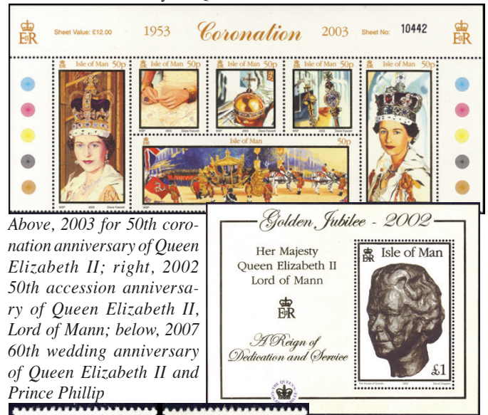
Above, 2003 for 50th coronation anniversary of Queen Elizabeth II; right, 2002 50th accession anniversary of Queen Elizabeth II, Lord of Mann; below, 2007 60th wedding anniversary of Queen Elizabeth II and Prince Phillip

The 75th birthday of Queen Elizabeth was celebrated in 2001