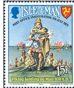
1973 single for postal independence (Sc. 28)

In 1973, the Isle of Man decided to take over control of postal matters and established an independent postal administration, the Isle of Man Post Office. Stamps were first released July 5, 1973. July 5 is Tynwald Day, the national day of the Isle of Man. A single stamp commemorating