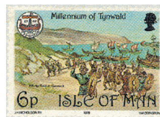
1979 Millennium of Tynwald, showing Viking raid (Sc. 148)

rule of King Magnus Haraldsson. The millennium of the parliament, Tynwald, was celebrated in 1979, with several stamp issues. One was devoted to the millennium itself, another set marked the visit of Queen Elizabeth II to Tynwald, another the voyage of the Viking ship replica Odin's Raven from Norway to the Isle of Man to participate in the cel-