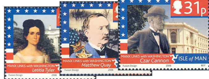
2006 "Links with Washington D.C."

There have been several Manx stamps with U.S. connections, one being the 2006 "Links with Washington D.C." issue, portraying these people with Manx ancestry: Letitia Christian Tyler, wife of 10th President John Tyler, Matthew Stanley Quay, Republican Senator from 1887, and Joseph Gurney Cannon (or "Czar Cannon"), Speaker of the House 1903-11.