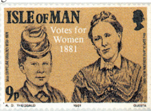
1981 for centenary of vote for women (Sc. 197)

The 1983 definitive series featured sea birds found around the island. Sea birds were also featured on a 1989 set of four. The Calf of Man Bird Observatory was highlighted on a 1994 set of six stamps and a souvenir sheet.