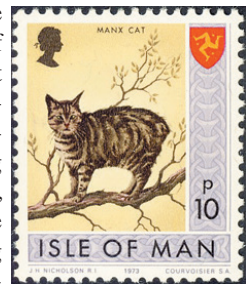
Manx cat on 1973 definitive (Sc. 24)

the establishment of the independent postal administration and illustrating the Viking landing AD 938, and a definitive series illustrating scenery and symbols of the island were the first two issues.