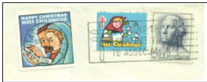
1965 NTA Seal double tied with 1965 Holy Childhood Seal. Note the tuberculosis logo cancel.

[5] Double-tied seals. This term refers to two [or more] different kinds of seals timely tied together on a single postcard or envelope. Examples would be a TB Christmas Seal tied with a Holy Childhood Association Christmas Seal, or a Lutheran Wheatridge Christmas Seal tied with a Boys Town Christmas Seal.