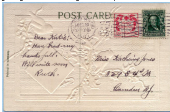
1907 Type 2 seal postmarked Wilmington, Delaware on December 25, 1907. Note an overlapping receiving mark, which is also dated December 25, 1907.

the Red Cross logo was replaced by the NTA's red double-barred Cross of Lorraine, which remains on seals to this day. [What was originally the NTA has changed its name to the American Lung Association and expanded its scope to fighting numerous lung diseases.]