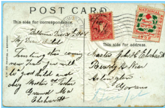
1908 Type 1A seal "nabbed" by the Post Office. Also note the mis-perforation error on the seal.

[1] Use as postage. This is the single most exciting factor for a collector. Even though much education has taken place that Christmas Seals are not postage, a number of people continued to use them that way. Most commonly today, they are placed on mailings to utilities, insurance companies, and various creditors. This type of usage appears to be a concerted protest against the addressees, hoping to make them pay postage due. As to catalog value, use as postage greatly increases the value of a tied seal, anywhere from tripling to quintupling it.