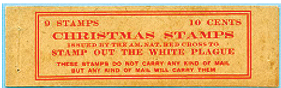
Cover for 1908 booklet of 9.

lectible today, and they are rare. Few people kept booklet covers once all the seals inside were used.