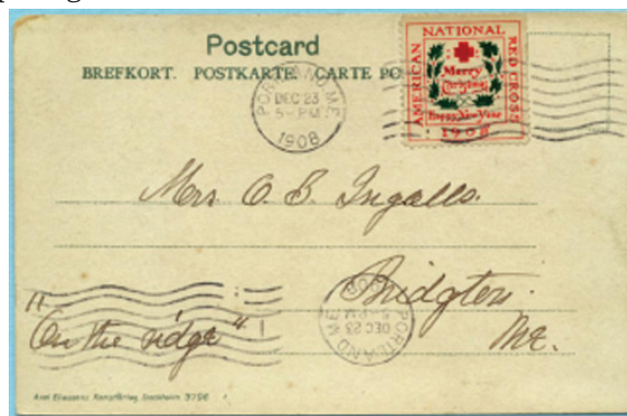
1908 Type 1A seal successfully used as postage.

Seals were officially called "Christmas Stamps" for the first three years of sale. This led to some confusion. By being called a "stamp," many people thought they were special postage stamps. Additionally, they were sold for one cent each, the same as the postage rate for postcards, the most common mode of use for seals in that time era. In December 1909, the U.S. Post Office Department issued a plea for people to stop using these "Christmas Stamps" as postage.