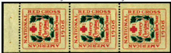
1908 Type 2 booklet pane of 3.

In both 1930 and 1931, there were booklets of 100 and 200 seals. Of these, the 1930 intact booklet of 100 is a scarcity, but the others remain common. In 1939, there was a booklet of 200 seals issued, and it remains common. There were experimental booklets of the 1923 seal, but not sold to the public. Only two were known. One remains intact and the other was broken into individual panes and sold by a dealer.