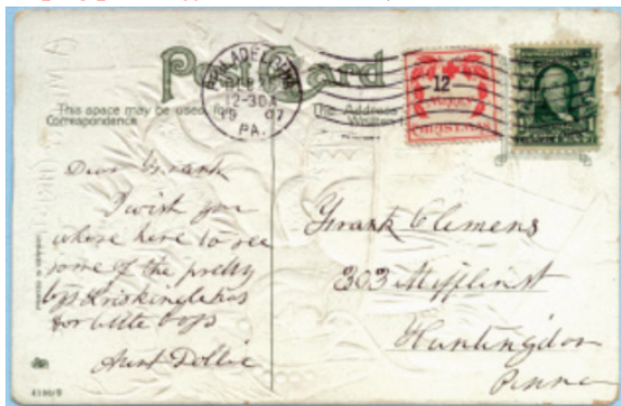
1907 Type 1 seal postmarked Philadelphia on December 25, 1907.

(The following article is from the November-December 2010 issue of "Book Reports" and is excerpted with permission from the Northwest Philatelic Library. For more information, you can visit < www.nwpl.org > or email them at < nwpl@qwestoffice.net >. JFD.)