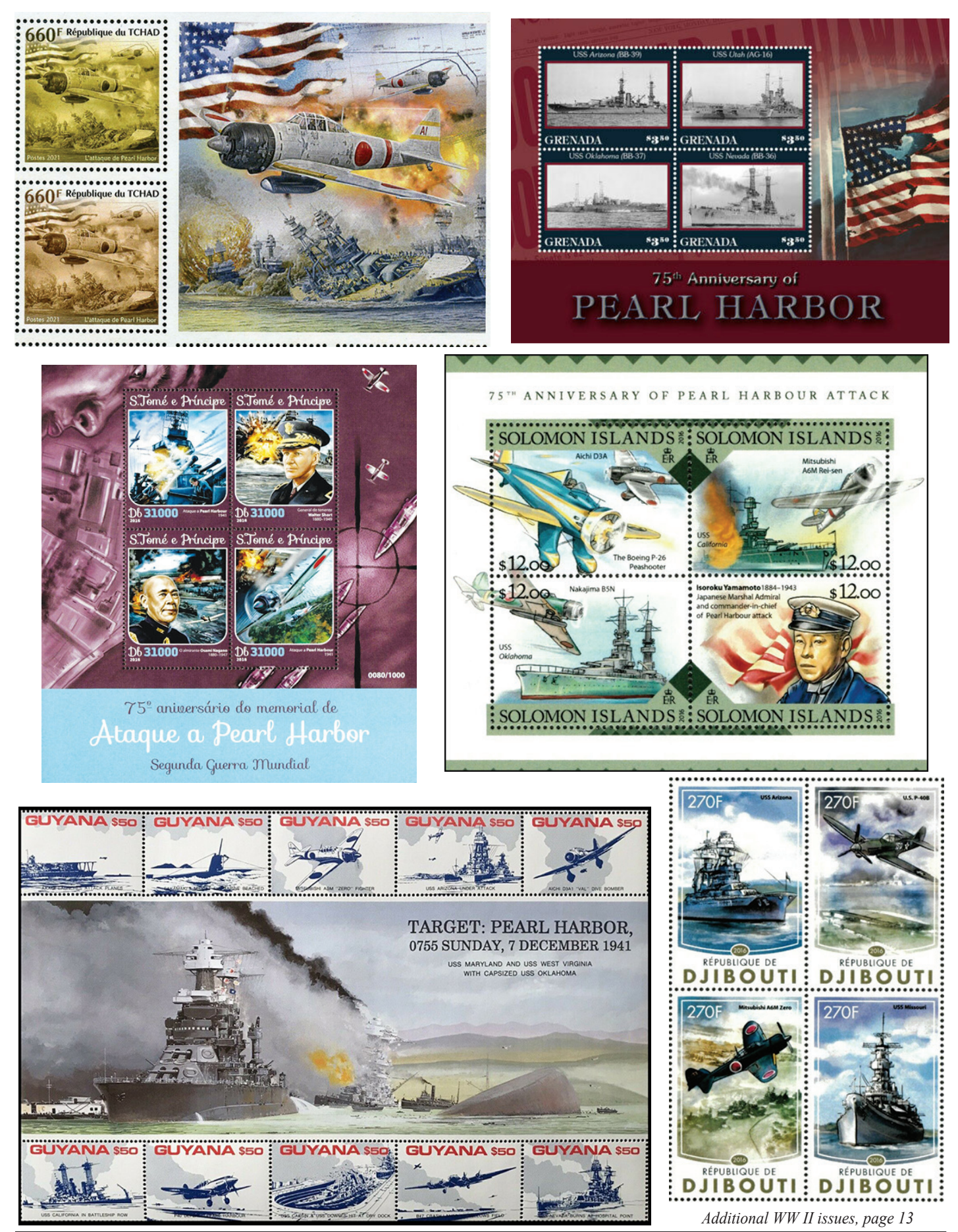
Mekeel's & Stamps MAGAZINE