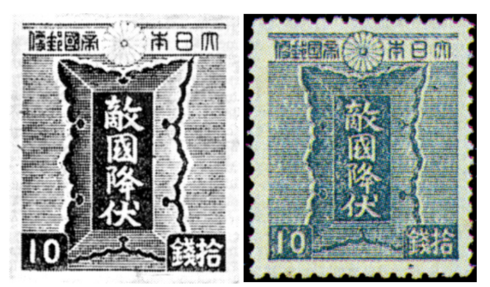
Left, the illustration of the subject stamp from the 1948 article, right a recent illustration of the stamp, Sc. 335

We must now jump in time from 1592 to 1945, at which latter time the