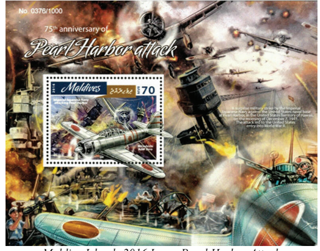
Maldive Islands 2016 Issue, Pearl Harbor Attack

At 2:22 PM, EST, the Associated Press sent out a Flash: "WHITE HOUSE SAYS JAPS ATTACK PEARL HARBOR," and word of the surprise attack rolled like thunder across the country as movie theaters and radio broadcasts interrupted programs of ball games and music. Millions more learned from friends and neighbors, over the back fence, on street corners, from the driver in the next car at a stoplight. After a generation of peace, America's turn had come.