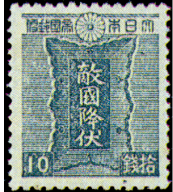
Japan 335: "Enemy Country Surrender" (See also, page 12)

In Tokyo, Emperor Hirohito declared war on the United States and Great Britain eight hours after the attack on Pearl Harbor, accusing them of prolonging the war in China by aiding Chiang Kaj-shek's government The war declaration "has been truly unavoidable," the Emperor said.