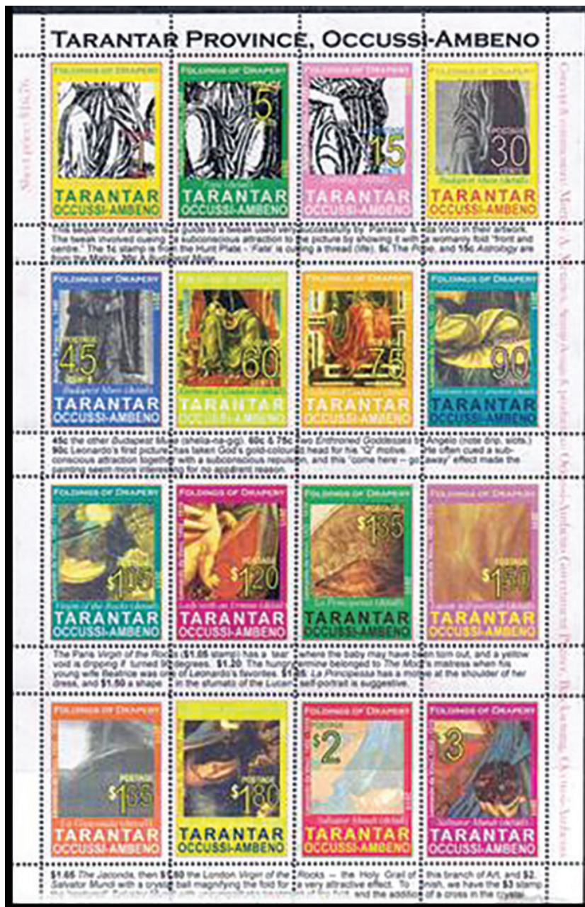
2011 Foldings of Drapery by DaVinci and Angelo