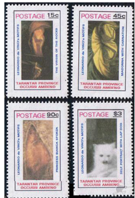
2011, probably 2011 details from works by da Vinci