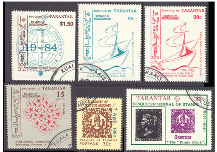
A selection of Tarantar issues:

Top: 1. 1989 5th anniversary of International Council of Independent States; 2.-3. 1989 200th anniversary of Bounty Mutiny Bottom: 1. 1989 World Starcross Championships; 1989 definitive; 3. 1990 150th anniversary of Penny Black