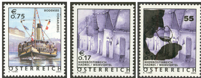
Left to right, 2002-03 definitive, Sc. 1873; 2002 definitive, Sc. 1864; 2005 surcharge, Sc. 1980

Along with several other EU countries, Austria adopted the Euro in 2002. A definitive issue featuring tourism spots was issued January 1, 2002, along with a single stamp marking the introduction of the Euro. The tourism series was complemented with additional values in 2003. In 2004-05, most values of this series were surcharged with new values. In 2006 an additional value was added.