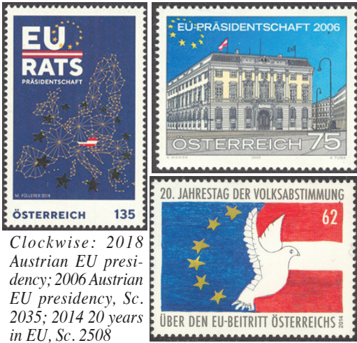
Clockwise: 2018 Austrian EU presidency; 2006 Austrian EU presidency, Sc. 2035; 2014 20 years in EU, Sc. 2508

During the second half of 1998, Austria held the Presidency of the EU and issued a stamp to publicize it. Austria also held the Presidency during the first half of 2006 and issued another stamp for it. During the second half of 2018, Austria again held the EU Presidency and issued a stamp to publicize it.