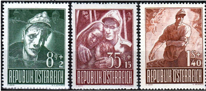
Above, 1947 Return of Prisoners of War, Sc. B218, B221, B223;

In 1947, semi-postals were issued to support former prisoners-of-war. A similar series appeared in 1948.