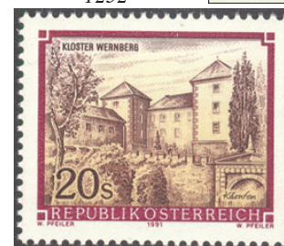
1984-92 definitive, Sc. 1472

A new definitive series featuring monasteries and abbeys was issued from 1984 till 1992. Between 1993-95 a series again featuring monasteries and abbeys but in a completely different design was issued.