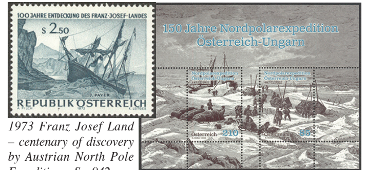
1973 Franz Josef Land – centenary of discovery by Austrian North Pole Expedition – Sc. 942

In 1979, the United Nations' Vienna International Center opened, and the United Nations started issuing distinct stamps for its Vienna office.