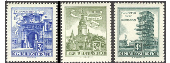
1957-70 definitives: left, Swiss Gate, Vienna, Sc. 699; center, Steiner Gate, Krems, Sc. 626; right, Schwechat Airport, Vienna, Sc. 627A

A definitive series featuring heritage buildings and monuments was first issued 1957, with new designs added up till 1970.