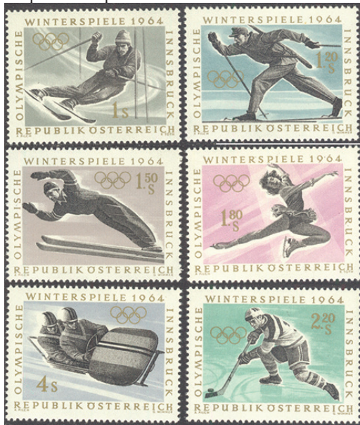
1963 Innsbruck Olympics 1964 – Sc. 711/17

for the Games in 1963. Innsbruck also hosted the Winter Olympics in 1976, and eight semi-postal stamps were issued for the Games in 1975.