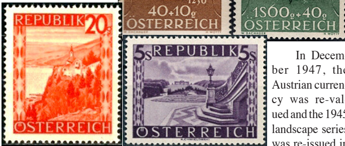
1947 interim definitives, Sc. 505, 515

as a temporary measure pending the introduction of a new definitive series, the 1948 Provincial Costumes series.