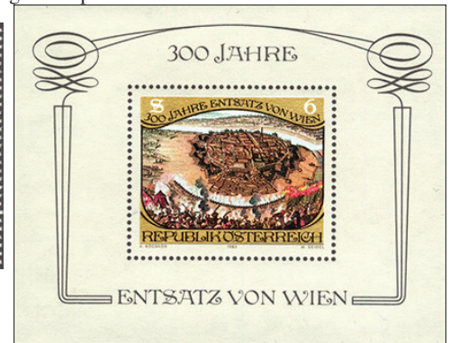
1983 Relief of Vienna – Sc. 1253

A new definitive series featuring monasteries and abbeys was issued from 1984 till 1992. Between 1993-95 a series again featuring monasteries and abbeys but in a completely different design was issued.