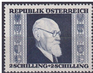
Top, 1946 Renner, Sc. B168

In 1951 a single mourning stamp was issued on the death of Renner and showing a portrait of him. In 1958, his portrait appeared on a stamp celebrating the 40th anniversary of the Austrian Republic and in the same design as the 1948 issue. Three stamps were issued in 1968 for the 50th anniversary of the Austrian Republic, one of them showing a portrait of Renner. Another stamp featured the national arms and the arms of the constituent states of the Republic.