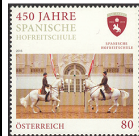
1975 400 years Spanish Riding School, Sc. 929; 2015 450 years Spanish Riding School, Sc. 2570

In 1873, an Austrian expedition discovered the Arctic islands they named Franz Josef Land, and the centenary of their discovery was honored on a 1973 single. In 1926 the archipelago was annexed by the Soviet Union and is part of the Arkhangelsk region. In 2022, the 150th anniversary of the Austrian North Pole expedition that discovered Franz Josef Land was commemorated with a souvenir sheet.