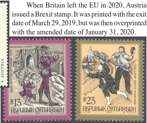
1997-2000 definitives: Left, Pied Piper from Korneuburg, Sc. 1746; right, Bread Loaf Monument, Sc. 1811

During 1997-2000 a definitive series featuring myths and legends was issued.