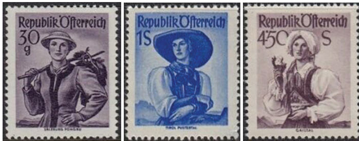
1948 costumes definitives, from full set, Sc. 520-56:

as a temporary measure pending the introduction of a new definitive series, the 1948 Provincial Costumes series.