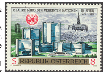
1989 UNO City 10 year Sc. 1477

In 1983 the visit of Pope John Paul II and the 300th anniversary of the relief of Vienna (from Turkish sieges) were commemorated on single stamps.