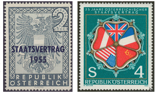
Left, 1955 State Treaty, Sc. 604; right, 1980 25th anniversary State Treaty, Sc. 1152

single stamp marking the 1955 State Treaty when the four Allied powers signed a treaty with Austria, re-establishing its sovereignty and ending the Allied occupation. The stamp was one of the 1945 stamps of the Soviet zone overprinted "STAATSVERTRAG 1955".