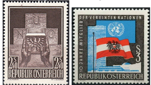
Left, 1956 UNO membership, Sc. 610; upper right, 1965 10th anniversary UNO membership, Sc. 754; right, 1985 30th anniversary UNO membership, Sc. 1317.

As a sovereign state, Austria was granted membership in the United Nations Organization, and this was marked with a 1956 stamp. In 1965, the tenth anniversary of Austria's UNO membership was celebrated with a single stamp, and for the 30th anniversary a stamp was issued in 1985.