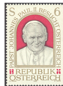
1983 Papal visit (John Paul II), Sc. 1252