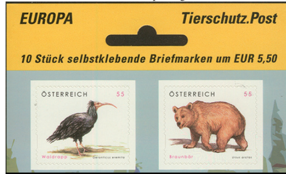
2006 Wildlife self-adhesive sheet stamps, 2006, Sc. 2071-72

Concurrently with this series was 2006-10 a series of self-adhesive stamps issued in sheets or coils and depicting animals.