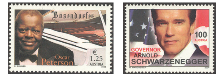
2006 Muhammad Ali, Sc. 2038; 2003 Rolling Stones, Sc. 1924; 2003 Oscar Peterson, Sc. 1941; 2004 Arnold Schwarzenegger, Sc. 1961