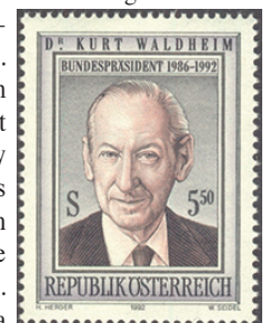
1992 Kurt Waldheim (as Austrian president), Sc. 1576

Controversial Dr. Kurt Waldheim was President of Austria 1986-92, and in 1992 his presidency was commemorated on a single stamp with his portrait. He had been Secretary-General of the United Nations 1972-81.