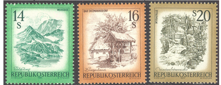
Left to right, Weissee, Salzburg, 1109; Openair Museum, Bad Tatzmannsdorf, Sc. 974; Myrawaterfalls, Sc. 975

In 1973 a new definitive series featuring natural scenery from around the country was issued, with new value added up till 1983.