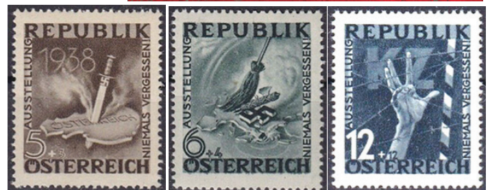
1946 anti-fascist exhibition, Sc. B171, B172, B174

forget". This set included two designs that were banned by the occupation authorities, but copies exist on the philatelic market.