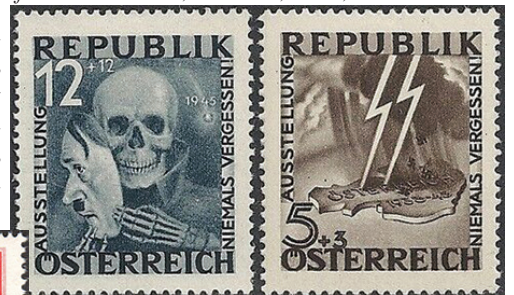
1946 anti-fascist exhibition unissued

forget". This set included two designs that were banned by the occupation authorities, but copies exist on the philatelic market.