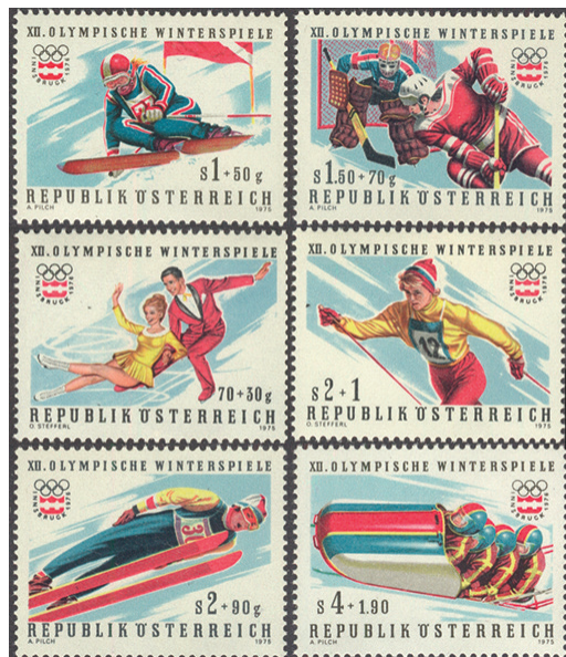
1975 Innsbruck Olympics 1976, Sc. B331/B338

A world-famous institution in Vienna is the Spanish Riding School, and in 1972 its 400th anniversary was celebrated with six stamps issued in a souvenir sheet. The 450th anniversary was celebrated in 2015 with a single stamp.