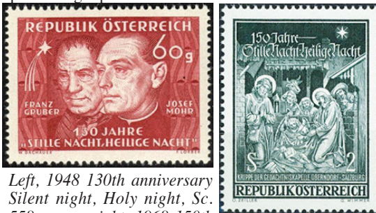
Left, 1948 130th anniversary Silent night, Holy night, Sc. 558; upper right, 1968 150th anniversary Silent night, Holy night, Sc. 823; right, 1955 10th anniversary 2nd republic, Sc. 599

The 30th anniversary of the Austrian Republic was celebrated with a single 1948 stamp featuring a portrait of President Renner. Also in 1948, the 130th anniversary of the Christmas carol "Silent Night, Holy Night" was commemorated with a single stamp. In 1968, the 150th anniversary of the carol was also commemorated on a single stamp.