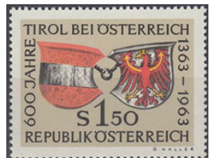
1963 600 anniversary Tyrol, Sc. 708

In 1964, Austria hosted the Winter Olympic Games in Innsbruck, and seven stamps with winter sport motifs were issued