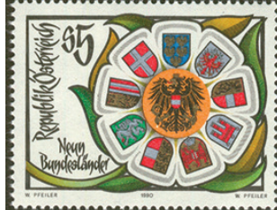
1990 45th anniversary federal state, Sc. 1518

The 25th anniversary of the Second Republic was commemorated with two 1970 stamps (one shown, next column), in 1975 the 30th anniversary was commemorated with a single stamp, in 1995 the 50th anniversary was commemorated with a 2005 souvenir sheet of two stamps.