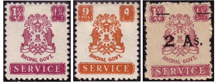
Left to right: 1945 1-1/2 annas, Sc. O50; 1946 9 pies, Sc. O48; 1949 surcharge, Sc. O58