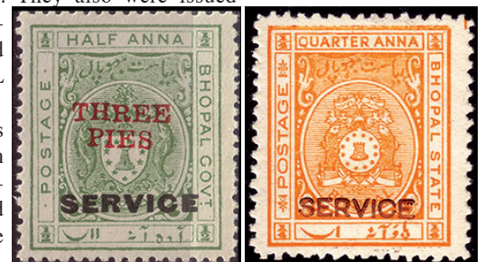
Left, Official 1935 3 pies surcharge, Sc. 019; right, Official 1936 quarter anna, Sc. 032