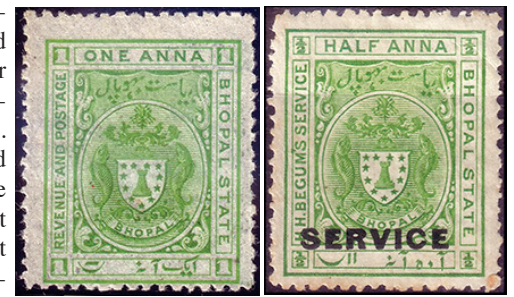
Left, 1/2a 1908 postage stamp, Sc. 99; right, 1908 1/2a Official, Sc. 01