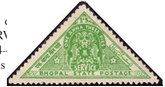
Official 1941 triangular, Sc. O45

A triangular stamp of the same (the 1935 issue, but inscribed "SERV" was issued in 1941, and during 1944- monocolour stamps in the palace designs were issued inscribed "SERVICE" (see O51 above).