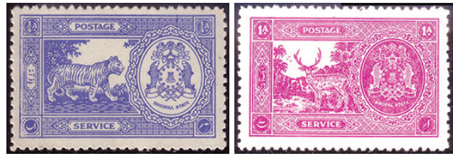
Official 1940 tiger, Sc. O43 Official 1940 spotted deer, Sc. O44

A similar design but featuring a tiger or a spotted deer appeared on 1940 stamps. These were inscribed "SERVICE".