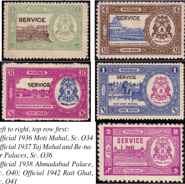
Left to right, top row first: Official 1936 Moti Mahal, Sc. O34 Official 1937 Taj Mahal and Be-nazir Palaces, Sc. O36 Official 1938 Ahmadabad Palace, Sc. O40; Official 1942 Rait Ghat, Sc. O41 Official 1945 Moti Masjid monocolour, Sc. O51

Bhopal's last official stamps were issued 1944-49 with the state arms as the central motif and inscribed "SERVICE". Two surcharged stamps in this design were issued in 1949. Bhopal official stamps became obsolete in 1950.