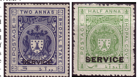
Left, 1930 2a, O11; right, 1932 1/2a inscribed Bhopal Govt., Sc. 014