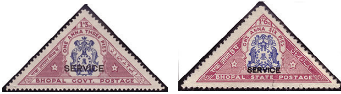
Left, 1935 triangular 1anna 3pies inscribed Govt. Postage, Sc. O30; right, 1937 triangular 1anna 6pies, Sc. O31

In 1935-38 triangular official stamps featured the state arms and were inscribed "BHOPAL GOVT POSTAGE" on the lowest value and "BHOPAL STATE POSTAGE" on two others, all additionally overprinted "SERVICE".