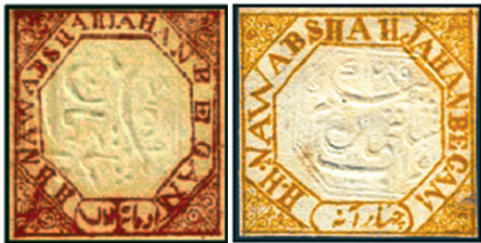
1876 first issue 1/2 anna Sc. 2, computer enhanced to show ruler's embossed name 1881 4a Sc. 17, computer enhanced to show ruler's embossed name