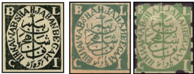
Left to right, 1884 1/2a, Sc. 22; 1886 1/2a imperf, Sc. 25, and perf, Sc. 27