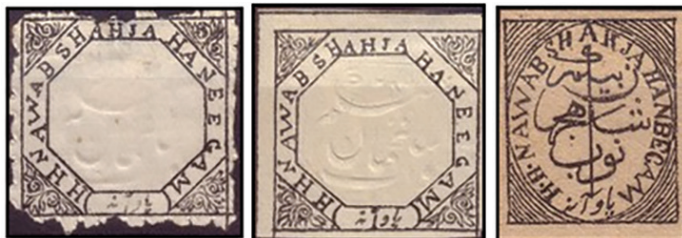
Above, left to right, 1895 perf 1/2a, Sc. 66; 1895 1/2a imperf, Sc. 61; 1899 1/2a Sc. 75; Right, 1890 1/2a, Sc. 50. This and all of the above bear Nawab Shah Jahan Begum's name.

oval. The ruler's title was additionally embossed in Urdu, on the stamps with octagonal frames, the embossing was applied in the center.