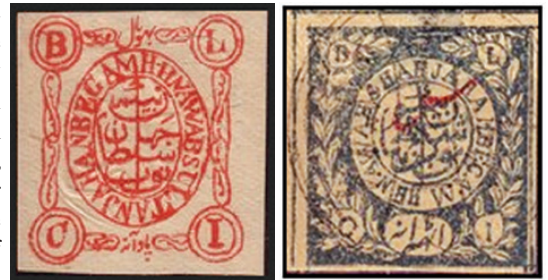
Left, 1902 1/2a, Sc. 76; right, 1903 1/2a, Sc. 83 (old issue overprinted with the initial in red of the new Begum)

Several surcharges on these stamps appeared 1935-36.