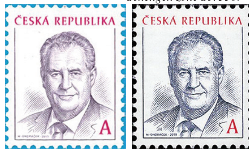
Czech President Zeman: left, 2013; right 2018

In 2013 Miloš Zeman (born 1944, President 2013-2023) became President and his effigy appeared on a 2013 stamp. After his re-election in 2018 he was also pictured on a 2018 stamp.