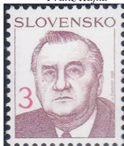
Slovakia 1993 President Kováč Sc. 159A