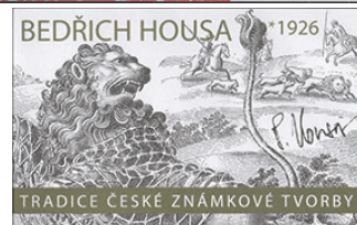
Czech 2020 stamp tradition front design half