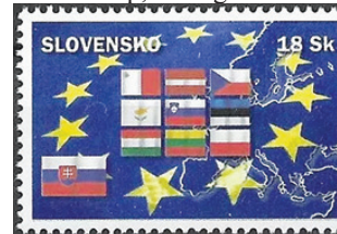
Slovakia 2004 EU membership Sc. 455

Like the Czech Republic, Slovakia in 2004 issued stamps for the country's admission to the European Union and to NATO. During the second half of 2016 Slovakia held the presidency of the European Union