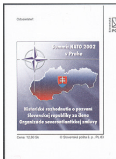
Slovakia 2002 postal card NATO summit in Prague

In 2009 Slovakia adopted the Euro and issued a stamp to publicize it. New stamps in Euro were of course also issued.