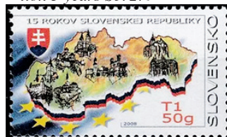
Slovakia 2008 Republic 15 years Sc. 534

The fifth anniversary of the Constitution of the Slovak Republic was commemorated on a 1997 stamp featuring the state arms, and the fifth anniversary of the Slovak Republic was celebrated on a January 1, 1998, stamp.