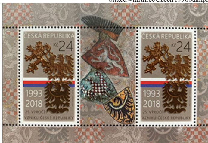
Czech 2018 Czech Republic 25 years