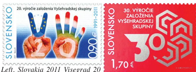
Left, Slovakia 2011 Visegrad 20 years; right, 2021 Visegrad 30 years

In 2011 Slovakia also issued a stamp for the 20th anniversary of the Visegrad Group, and for the 30th anniversary in 2021.