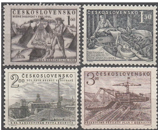
1952 miners' day Sc. 548-51

day was featured on three 1951 stamps, on four 1952 stamps, and on two 1953 stamps. In 1962, a single stamp remembered the 30th anniversary of a miners' strike in Most. In 1982, a stamp was issued for the 50th anniversary of this strike.