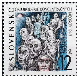
Slovakia 1995 liberation of concentration camps 50 anniversary Sc. 214

In 2020 a stamp was issued to remember the tragic January 1945 events in Ostrý Grúň and Klak when an anti-partisan group attacked these two villages and murdered 150 people.