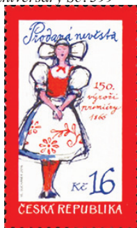
Czech 2016 Smetana's The Bartered Bride 150 years