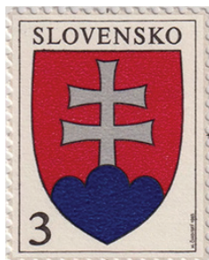
Slovakia 1993 state arms Sc. 150

As with the Czech Republic stamps of Czechoslovakia remained valid for postage until September 30, 1993.