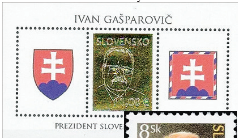
Above, Slovakia 2009 President Gasparovic gold foil;

President Schuster was succeeded by Ivan Gašparovič (born 1941, President 2004-14). His effigy first appeared on a June 2004 stamp in photogravure, and then on an engraved 2005 stamp. In 2009 a gold foil stamp in Euro currency with his effigy and in 2010 an engraved stamp in Euro currency were issued.