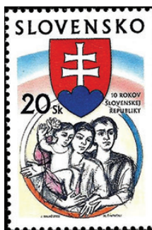
Slovakia 2003 Republic 10 years Sc. 420