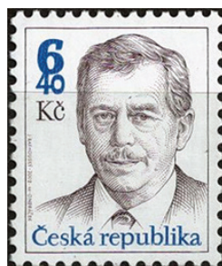
right, Czech 2002 President Havel Sc. 3180