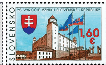
Slovakia 2018 Republic 25 years

and the 25th anniversary with a 2018 stamp.