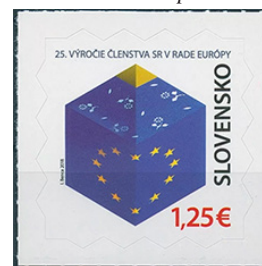
Slovakia 2018 EU membership 25 years