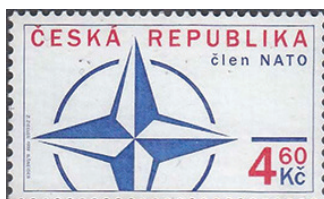
Czech 1999 NATO membership Sc. 3086