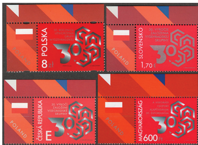
Visegrad 30 years joint issue

these countries' accession to the European Union, these countries have formed an opposition within the European Union advocacy for less power to EU bodies and more sovereignty for the member states. The Czech republic issued a stamp for the 20th anniversary of the Visegrad Group in 2011, and another for the 30th anniversary in 2021.