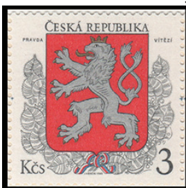
Czech 1993 state arms Sc. 2877

public released its first stamp January 20, 1993, showing the national arms. A stamp with the effigy of President Havel was issued March 2, 1993. A similar stamp was issued March 22, 1995. His 60th birthday was celebrated 1996 with a souvenir sheet with two stamps with his effigy. A new portrait of Havel appeared on a 1998 stamp, and on a 2002 stamp.