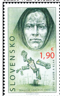
Slovakia 2020 tragic 1945 events in Ostry Grun and Klak

In 1995, Slovakia issued a stamp for the 50th anniversary of the liberation of the Nazi concentration camps, and in 2017 a stamp with tribute to the victims of Holocaust was released.