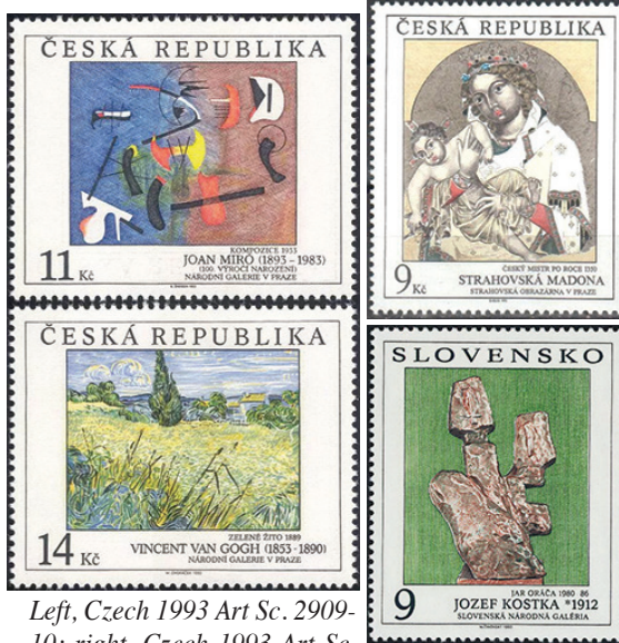
Left, Czech 1993 Art Sc. 2909-10; right, Czech 1993 Art Sc. 2908, Slovakia 1993 Art Sc. 175

In 1966 the first series of stamps reproducing art was issued. This set consisted of five stamps. Similar sets followed every year 1967-1992 except for 1968. The Czech Republic and Slovakia have continued the concept with similar annual series.