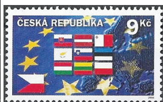
Czech 2004 EU membership Sc. 3236

In 2004, the Czech Republic became a member of the European Union, and two 2004 stamps celebrated the event. One of the stamps showed the flags of all 10 new member states of the EU. In 2007 the country also became a member of the Schengen Border-Free Zone, also commemorated on a stamp.