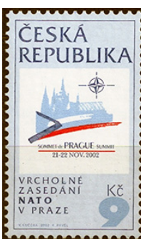
Czech 2002 NATO summit Sc. 3183

The 80th anniversary of the Czechoslovak Republic was celebrated with three Czech 1998 stamps.