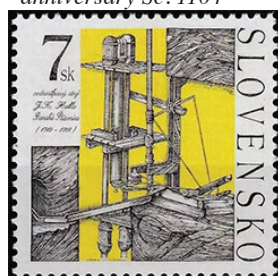
Slovakia 1999 mine pump Sc. 338