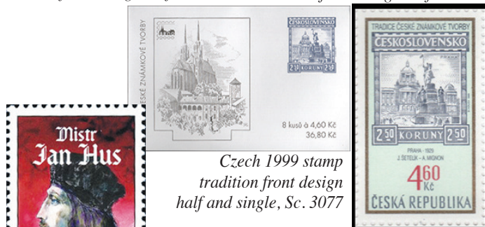
Czech 1999 stamp tradition front design half and single, Sc. 3077