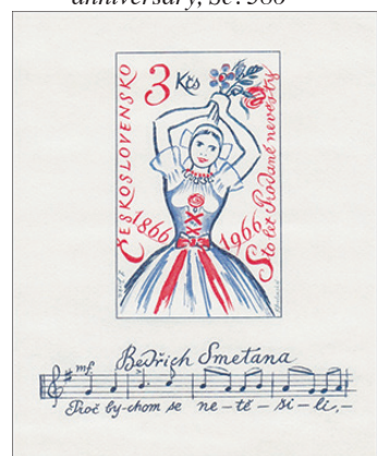
1966 Smetana's The Bartered Bride Sc. 1373

"The Bartered Bride", was celebrated with a 1966 souvenir sheet, and in 2016 the 150th anniversary of the premier of the opera was commemorated on a Czech stamp.