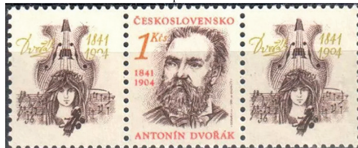
1991 Dvorak 150 birth anniversary Sc. 2820

"The Bartered Bride", was celebrated with a 1966 souvenir sheet, and in 2016 the 150th anniversary of the premier of the opera was commemorated on a Czech stamp.