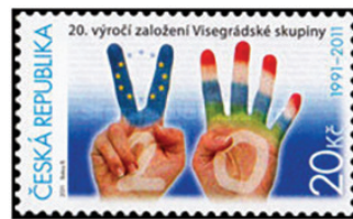
Czech 2011 Visegrad 20 years

In 2008 a stamp was issued for the Czech presidency of the European Union for the first half of 2009. In