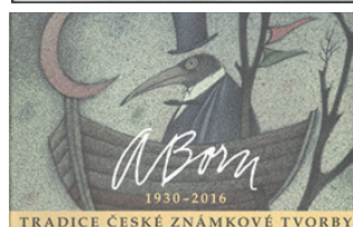
Czech 2019 stamp tradition front design half