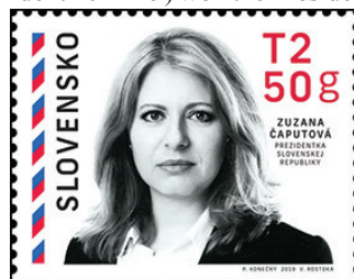
Slovakia 2019 Pres. Caputova

In 2014 Andrej Kiska (born 1963, President 2014-19) won the Presidential election and he was portrayed on a 2014 stamp.