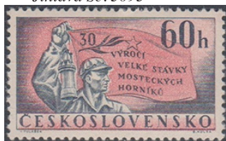
1962 miners' strike 30th anniversary Sc. 1104

The Czech Republic in 1999 issued a stamp for the 750th anniversary of the granting of mining rights in Jihlava, and in 2000 for the 700th anniversary for the Kutna Hora mining law. Slovakia in 1999 issued a stamp illustrating a mine water pump invented by Jozef Hell.