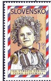
Slovakia 2018 Czecho-Slovakia centenary

and the 25th anniversary with a 2018 stamp.