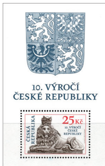
Czech 2003 Czech Republic 10 years Sc. 3191

public released its first stamp January 20, 1993, showing the national arms. A stamp with the effigy of President Havel was issued March 2, 1993. A similar stamp was issued March 22, 1995. His 60th birthday was celebrated 1996 with a souvenir sheet with two stamps with his effigy. A new portrait of Havel appeared on a 1998 stamp, and on a 2002 stamp.