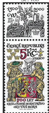
Czech 2000 Kutna Hora mining law Sc. 3112

The Czech Republic in 1999 issued a stamp for the 750th anniversary of the granting of mining rights in Jihlava, and in 2000 for the 700th anniversary for the Kutna Hora mining law. Slovakia in 1999 issued a stamp illustrating a mine water pump invented by Jozef Hell.