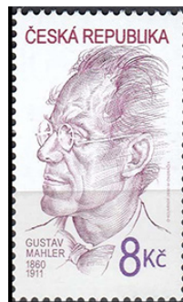
Czech 2000 Mahler 140th birth anniversary Sc. 3119

The composer Gustav Mahler was remembered on the 140th anniversary of his birth with a 2000 stamp of the Czech Republic.