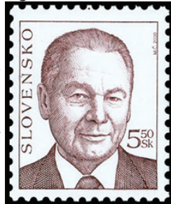
Slovakia 2000 President Schuster Sc. 358

as President. His effigy appeared on a June 2000 stamp, and again on a 2003 stamp.