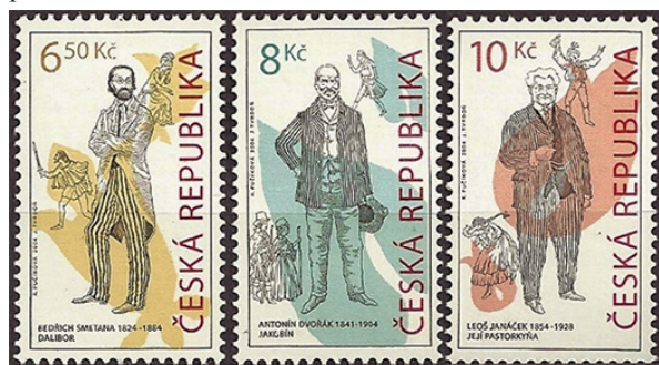
Czech 2004 operas Sc. 3238-40

The 150th birth anniversary of Dvořák was celebrated on a 1991 stamp.