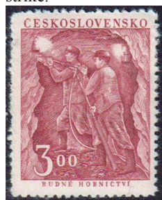
1951 miners' day Sc. 480