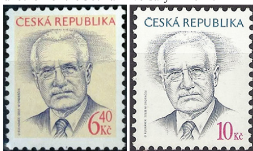
Czech 2003 President Klaus Sc. 3208

Václav Havel was succeeded as Czech President by Václav Klaus (born 1941, President 2003-13). His effigy appeared first on two 2003 stamps, with a third stamp added in 2005, and a fourth in 2008.