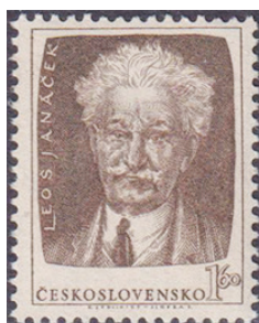
1953 Janacek 25th death anniversary Sc. 599

The 25th death anniversary of Czech composer Leoš Janáček was commemorated 1953 with a single stamp. In 1954 both Smetana and Janáček were portrayed on stamps along with Czech composer Antonín Dvořák. The centenary of Smetana's opera, "The Bartered Bride", was celebrated with a 1966 souvenir sheet, and in 2016 the 150th anniversary of the premier of the opera was commemorated on a Czech stamp.