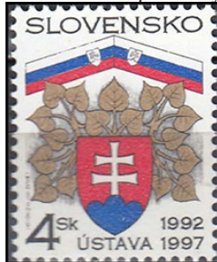
Slovakia 1997 Constitution 5 years Sc. 279

Two stamps with the effigy of Slovak President Michal Kováč (1930-2016, President 1993-98) were issued in March and November respectively.