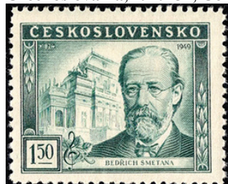
1949 Smetana 125 birth anniversary, Sc. 386