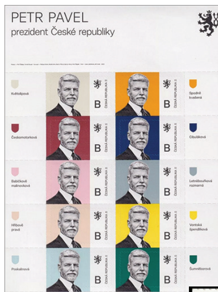
Czech 2023 President Pavel