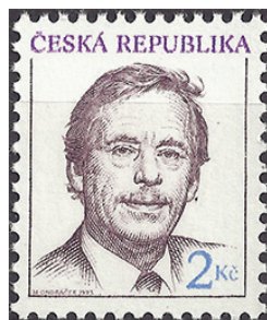
Left, Czech 1993 President Havel Sc. 2879;