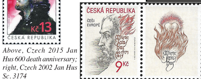
Above, Czech 2015 Jan Hus 600 death anniversary; right, Czech 2002 Jan Hus Sc. 3174

The Czech religious reformist Jan Hus (1372-1415) who was burned at the stake for heresy against the teachings of the Catholic Church was remembered on 2002 and 2015 Czech stamps, the latter on the 600th anniversary of his death.