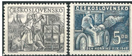
1949 mining industry Sc. 394, 396, 700th anniversary of Czechoslovak mining industry and 150th anniversary of the miners' laws

The important mining industry of Czechoslovakia was honored on three 1949 stamps and again on two 1951 stamps. The miners'