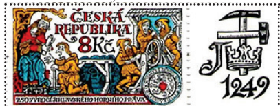
Czech 1999 mining rights in Jihlava Sc. 3095