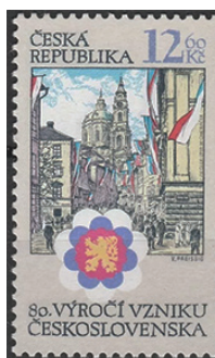
Czech 1998 Czechoslovak Republic 80 years Sc. 3060

The 80th anniversary of the Czechoslovak Republic was celebrated with three Czech 1998 stamps.