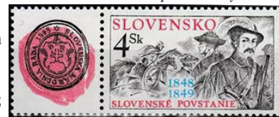
Slovakia 1998 1848-49 uprising Sc. 305

A 1998 stamp remembered the 1848-49 uprising in Slovakia.