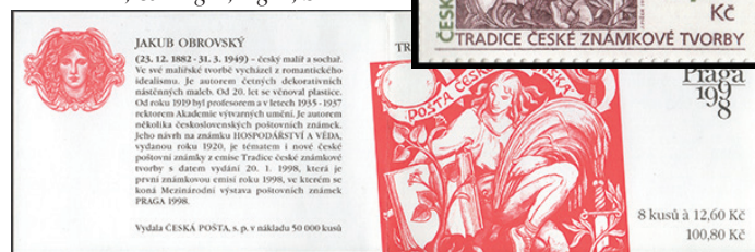
Czech 1998 stamp tradition front, below, & single, right, Sc. 3032