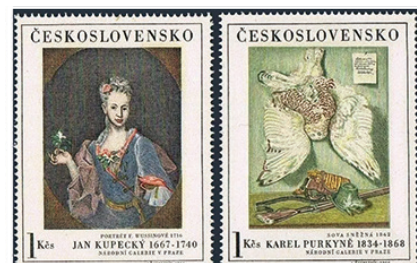
1966 Art first issue Sc. 1435-39

The composer Gustav Mahler was remembered on the 140th anniversary of his birth with a 2000 stamp of the Czech Republic.