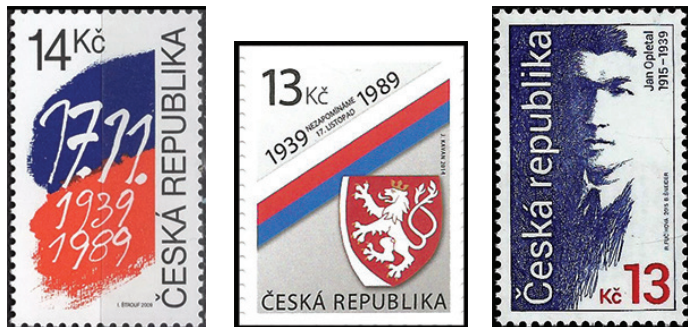
Left to right: Czech 2009 student demonstrations 1939 and 1989; 2014 student demonstrations 1939 and 1989; 2015 Jan Opletal birth centenary

In 1939 Czech students demonstrated against the Nazi occupation of the country and on November 17, 1939, the demonstrations were violently dissolved by the Nazi authorities with many casualties, the closure of universities and over 1000 students sent to concentration camps. On November 17, 1969, a similar student demonstration was violently dispersed and many students wounded by police beating. In 2009 and 2014, both incidents were commemorated on stamps. In 2015 the student Jan Opletal, who was killed in the 1939 demonstrations was honored on a stamp on the centenary of his birth.