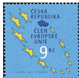
Czech 2004 EU membership Sc. 3235