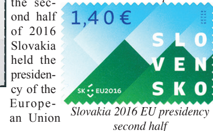
Slovakia 2016 EU presidency second half

and issued a stamp to publicize it. The 25th anniversary of Slovakia's membership of the European Union was celebrated with a 2018 stamp. In 2002 Slovakia issued a pre-stamped postal card for the NATO Summit in Prague.