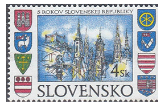
Slovakia 1998 Republic 5 years Sc. 292