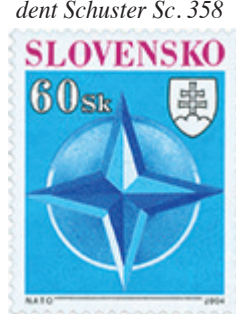
Slovakia 2004 NATO membership Sc. 456

Like the Czech Republic, Slovakia in 2004 issued stamps for the country's admission to the European Union and to NATO. During the second half of 2016 Slovakia held the presidency of the European Union