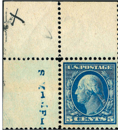
Sc. 361, with ‘x’ in sheet margin

For identification, in the case of these denominations, the Bureau marked each of the sheets in the margins with an “x” penned in black ink, and in April, 1909, 400 stamps of each value were delivered to the Post Office Department. These were distributed, according to Travers’ later statement (after his indictment, separately, and again jointly with Joseph A. Steinmetz, for alleged, irregularities in the subsequent disposal of some of the stamps), as follows: 100 each to the Third Assistant’s office, and placed in the office safe; 100 each to the Postal Museum for the official stamp collection; 100 each retained for official files; and 100 each held as surplus.