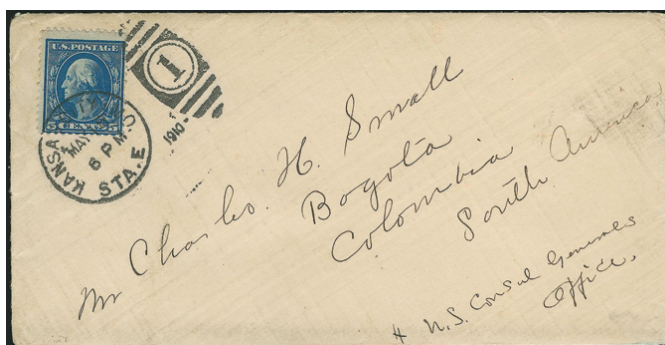
Sc. 361, 5¢ on Bluish paper (Sc. 361), tied by “Kansas City Mo. Sta. E. May 18 6 P.M. 1910” duplex cancel on cover to Bogota, Colombia, one of five known used and three known on cover.

understanding at the Bureau, were mixed with ordinary stock and distributed to post offices. Most values were later discovered in various cities, but the 4¢ and 8¢ were never found.