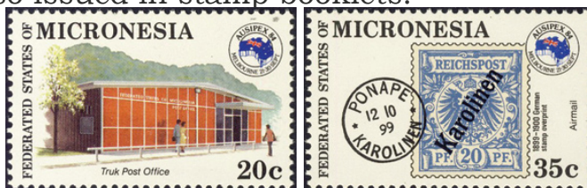
Left, 1984 Truk post-office (Sc. 21); right, 1984 with 1899 German colonial stamp (Sc. C5)

The post-office on Truk was depicted on a 1984 stamp issued in honor of the Ausipex philatelic exhibition in Melbourne, Australia.