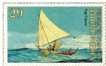
1993 native canoes, here Yap voyaging canoe, or Waaliwaiy (Sc. 173)