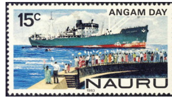
Left, 1986 return of Nauruans from Truk (Sc. C20); right, similar 1983 Nauru stamp (Sc. 273)

The Federated States of Micronesia were established 1979 and signed a compact of free association with the U.S. in 1986.