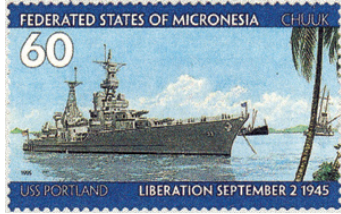
1995 50th anniversary of liberation (Sc. 231a)

In 1995, four Micronesian stamps marked the 50th anniversary of the liberation from the Japanese rule. A 1986 air post stamp had celebrated the 40th anniversary of the return of the deported population of Nauru from Truk. A similar stamp was is-