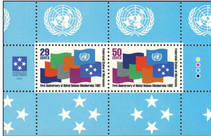
1992 1st anniversary of UN membership souvenir sheet (Sc. 153a)

The first anniversary of Micronesia's admission to the U.N. was celebrated with a pair of 1993 stamps. The 15th anniversary