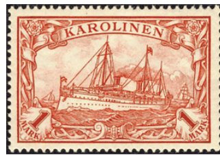
Caroline Islands 1901 (Sc. 9, Sc. 16)

The definitive series in the uniform designs showing the Imperial Yacht "Hohenzollern" was issued from January 1901 onwards. Like other German colonies, new