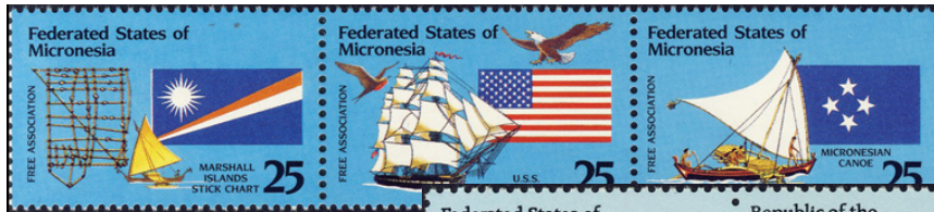
1990 compacts of free association with the U.S. for Micronesia (and the Marshall Islands): top Micronesian issue (Sc. 126a); bottom U.S. issue (Sc. 2507a)

The Federated States of Micronesia were established 1979 and signed a compact of free association with the U.S. in 1986.