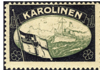
Post-WWI mourning label for 'lost colonies', here Caroline Islands

During WWII, the U.S. towards the end of the war managed to isolate the large Japanese garrisons on some of the Caroline Islands, and after the Japanese surrender, the islands came under U.S. administration, from 1947 as the Trust Territory of the Pacific Islands.