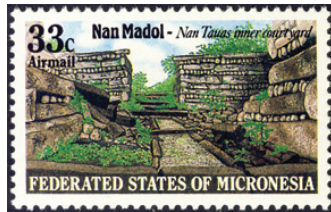
1985 Nan Madol ruins (Sc. C16)