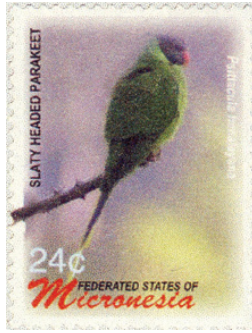
2006 Birds definitive

In 1990, there was a joint issue with the U.S. and the Republic of the Marshall Islands, celebrating the independence of the two Micronesian republics.