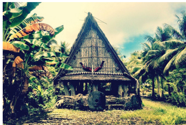
Tourism, top to bottom: 1993 Pohnpei Falls (Sc. 179); 1996 Yap meeting house (Sc. 239a); 1994 Kosrae “Sleeping Lady”.