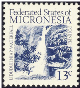
1984 definitive, Pohnpei Falls (Sc. 11)