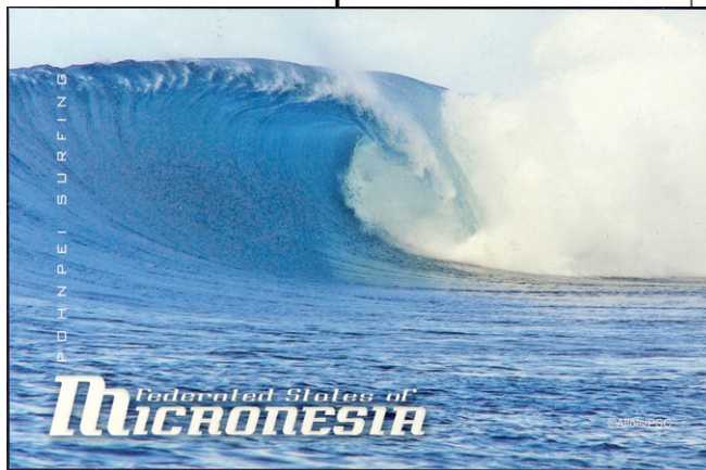
2009 surfing on Pohnpei postal card, same as Sc. 786 stamp

After independence, Micronesia has issued a few pre-stamped envelopes and postal cards. A 2009 set featuring surfing on Pohnpei was accompanied by pre-stamped postal cards with the same stamp imprints.