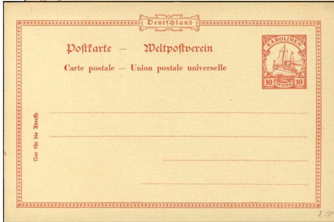
1899 postal card (Higgins & Gage 2)