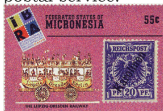
1999 showing German colonial stamp (Sc. 340)

Stamps of the German colonial era were reproduced on two stamps issued 1999 for the IBRA 90 philatelic exhibition in Nuremberg. Such stamps were also reproduced on a 1984 air post set for the Ausipex 84 exhibition in Melbourne (see page 7).