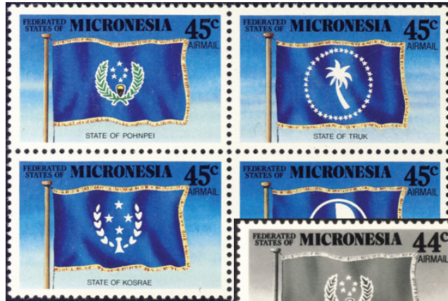
1989 flags of constituent states (Sc. C39-42).

The same stamps with 44¢ denominations were not issued because the name of two of the states had been erroneously transposed (shown in pre-release press photo)