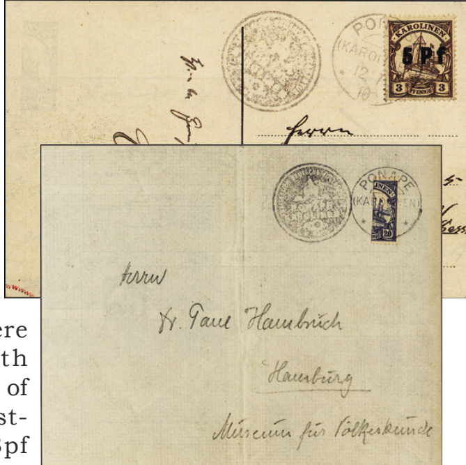
Top, 1910 5p provisional on card (Sc. 20); bottom, 1910 20p bisected and used as 10p, on cover

of 5pf and later, of 10pf stamps resulted in several provisionals being made at Ponape. At first, 10pf stamps were bisected to serve as 5pf stamps and were authorized with the official seal of the Ponape post-office. Later, 3pf stamps were surcharged 5pf, and 20pf stamps were bisected to serve as 10pf stamps.