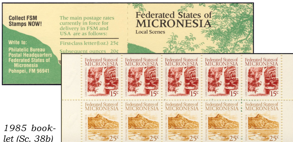
1985 booklet (Sc. 38b)

Further definitive values were added in 1986 and 1988, the latter were also issued in stamp booklets.