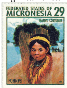
1994 costumes of the states, here Pohnpei (Sc. 193a)

9), a 1993 set depicting native canoes, a