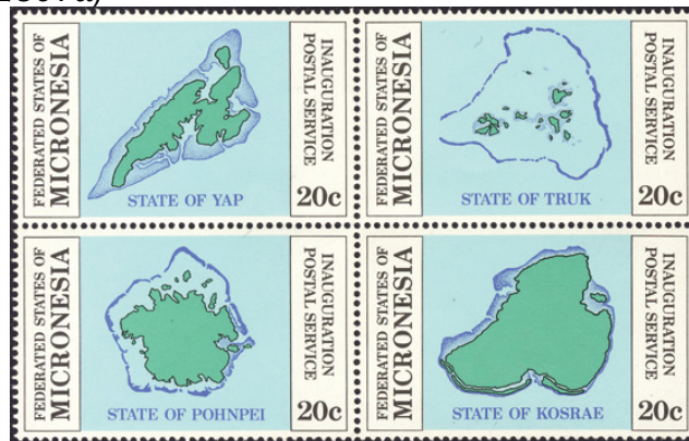
1984 postal independence (Sc. 1-4)

The Federated States of Micronesia issued their first stamps in 1984, when an independent postal administration was established. This was celebrated with a set of four