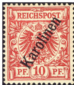
Caroline Islands 1900 (Sc. 3)

Germany took over the islands June 1, 1899, and already on October 12, 1899, a post-office was opened on Ponape (today's Pohnpei), followed in November by a post-office on Yap. Later, post-offices were opened on Palau (1907) and Truk (1905). German stamps overprinted "Karolinen" were also issued from October 12, 1899. Because of this, unoverprinted German stamps were not used on the islands.