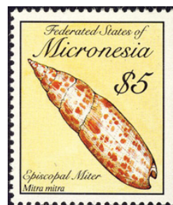
1989 seashells definitive (Sc. 102)

A new definitive series issued in 1989 depicted marine fauna, as did the 1998-2001 series. The 2002-04 series however, depicted flowers as well as birds, and the 2006-07 series featured birds, butterflies and fruits (see page 8).