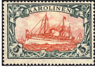
Caroline Islands 1915 (Sc. 23)

printings of these stamps, but on watermarked paper, were issued in Berlin during WWI, but were never available in the Carolines.