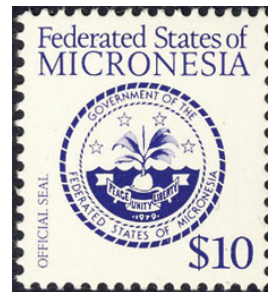
1985 definitive, Great Seal (Sc. 39)

One of the most impressive ancient monuments in the Federation is the ruins of the offshore Nan Madol capital of the Saudeleur dynasty which ruled the islands ca 500-1450 AD. Some of the ruins of this "Venice of the Pacific" were featured on a 1985 set of postage and air post stamps (see page 6).