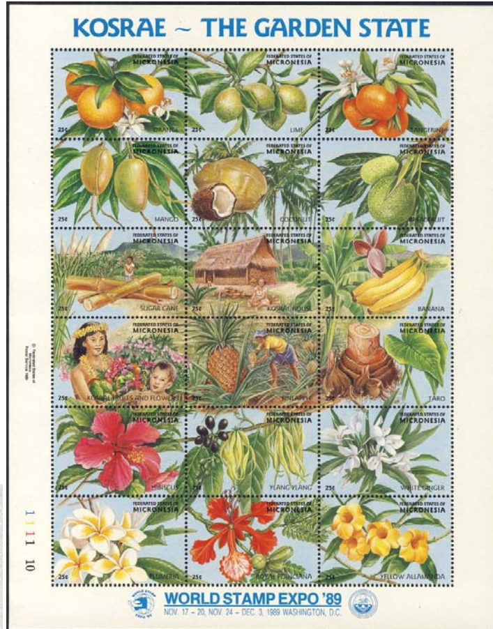
1989 sheetlet for Kosrae – The Garden State (Sc. 103)