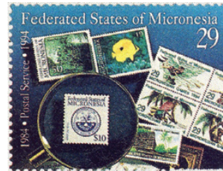
1994 10th anniversary of postal independence (Sc. 198a)

sary of the Micronesian constitution was marked with a 1994 stamp, and in 1994, four stamps celebrated the 10th anniversary of Micronesia's postal service.