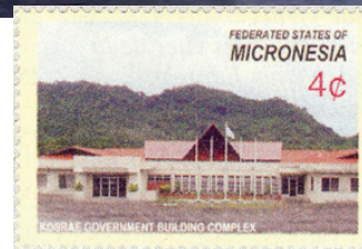
2005 Kosrae government complex

1994 set depicting local costumes, and also a 2003 set for the International Year of Water, although Yap is missing from this