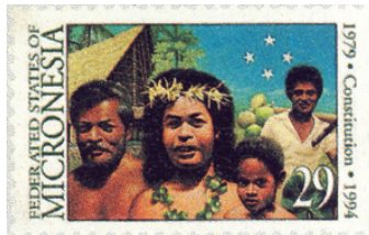
1994 15th anniversary of Constitution (Sc. 194)

sary of the Micronesian constitution was marked with a 1994 stamp, and in 1994, four stamps celebrated the 10th anniversary of Micronesia's postal service.