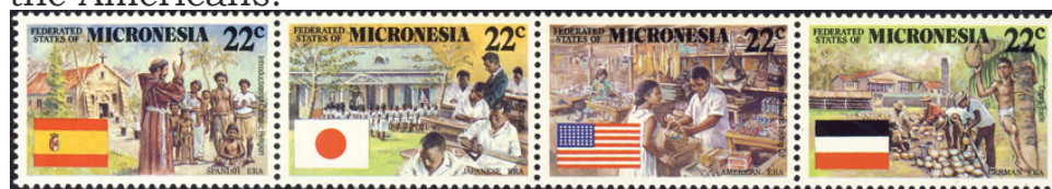
1988 colonial history of Micronesia (Sc. 59-62)

A 1988 series illustrated the colonial history of the islands, with the Spanish, the Germans, the Japanese and the Americans.