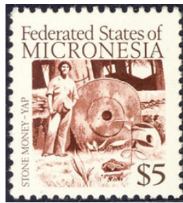
Stone money, Yap (Sc. 20)