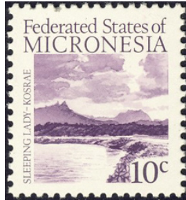
1984 definitive, Kosrae, showing the "Sleeping Lady" (Sc. 10)

A definitive series was issued simultaneously, portraying important persons in the history of the islands, and scenery from the constituent states.