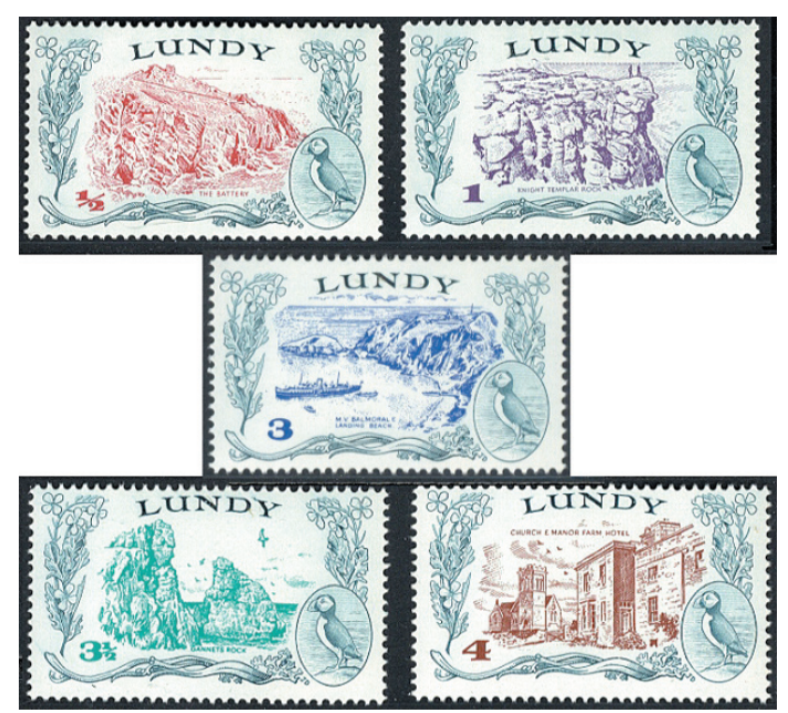
1971 decimal definitives showing local Lundy scenes

The images on this page are from material supplied by Geir Sør-Reime for a "World of Stamps—Island Communities" article we will be publishing on Lundy in a future issue of Mekeel's & Stamps Magazine.