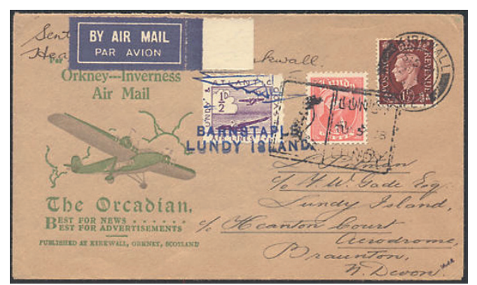
Incoming mail: an August 2, 1938 cover flown from Kirkwall, Scotland to Lundy Island with the cachet of the Orcadian, "Best for News, Best for Advertisers, Published at Kirkwall, Orkney, Scotland." The cover bears a Great Britain 1-1/2p, Lundy 1/2p definitive and 1937 1/2p Lundy Atlantic Coastal Air Lines (LACAL) airmail stamp.

Such "Puffinage" is required at Lundy in payment of postal charges to the "mainland" (England) and from the mainland to Lundy, for the very good reason that since no of-