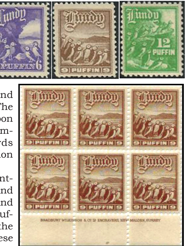
1930 9 Puffin block of six with "Bradbury Wilkinson & Co. Ltd Engravers, New Malden, Surrey" imprint

Issue 5 - May 6, 2011 - StampNewsOnline.net