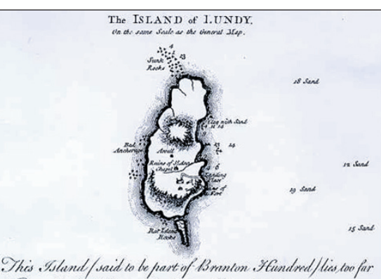
to Westward to be delineated in its true Place in this Map. She Middle of the Island is in 52 is to No Patitude, and 1.28 4 West Longitude, It bears from Bideford or Barnstaple Bar W.N.W.4 W. distant 19 Miles 1 Furlong, From Hartland Point N.N.W.4 W. distant it Miles 6 Farlongs, Und from Baggy Point W bN distant it Miles 6 Furlongs, The Figures flow the depth of Mater in Fathoms.

Although the printings of 1929 (1/2 and 1 Puffin values) and 1930 (6, 9 and 12 Puffin values) were the only printings of these stamps, according to Bradbury, Wilkinson & Co., there are in