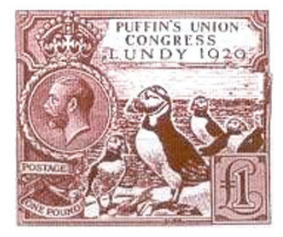
Not an actual Lundy issue, but a clever fantasy based on the Great Britain "Postal Union Congress (PUC) London 1929" issue, Sc. 209, changed to "Puffin's Union Congress Lundy 1929" and puffins replacing St. George Slaying the Dragon.

Issue 5 - May 6, 2011 - StampNewsOnline.net